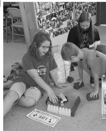
Playing Games at the Library!