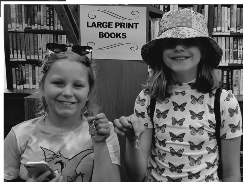
Beach Glass Jewelry Class